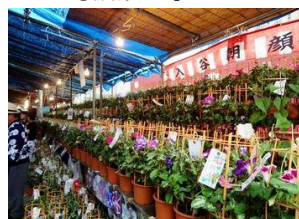
You can enjoy beautiful flowers. ↓ ②朝顔祭り Asagao Festival