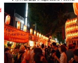
There are many shops and people wear traditional clothes. ↓ ④神楽坂祭り Kagurazaka Festival