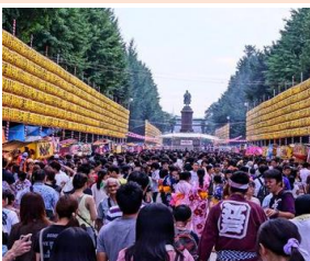
↑ ①みたまま祭り Mitama Festival You can enjoy Japanese traditional dance.