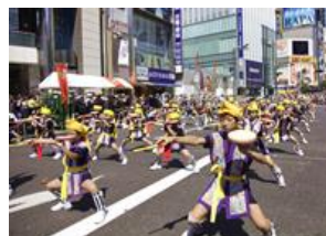
↑ ③エイサー祭り Eisa Festival You can enjoy fantastic music and dance in centre of Tokyo.