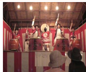
↑ ③鬼王神社例大祭 Kioujinja Reitaisai You can enjoy traditional music and dance.

You can enjoy beautifully illuminated shrine. ↓ ④靖国神社みらいとてらす Yasukuni Miraiterasu