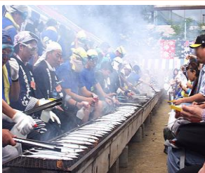
↑ ①目黒さんま祭り Meguro Pike Festival You can eat salt-grilled saury for free.

You can watch some films on the big screen in Shinjuku Central Park. ↓ ②Screen@shinjuku Central Park